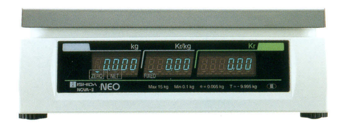
Display for customer